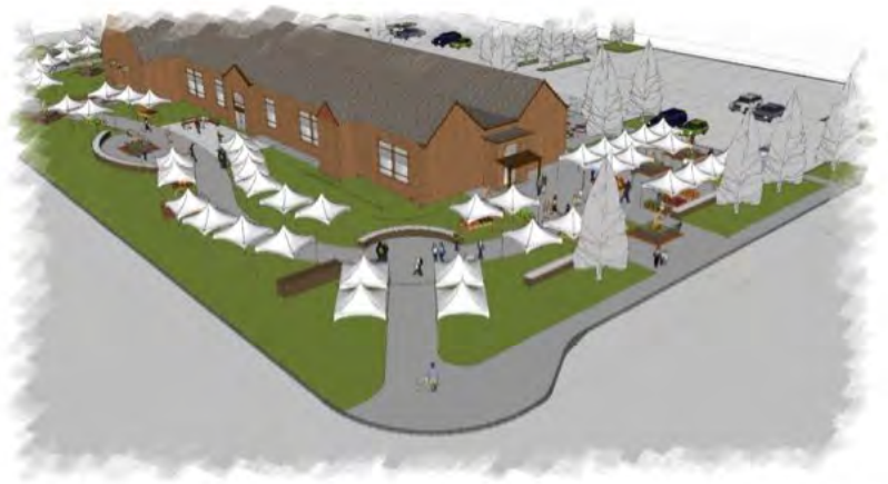
South Site Entry w/ Public Sidewalk & Pedestrian Node

In 2018, the LCCC Board of Directors made great strides toward our next big capital improvement: the Lincoln City Cultural Plaza. This project, currently budgeted at $1.8 million, will create an art-filled, pedestrian friendly space around the Center. The design, led by the Portland landscape architects Shapiro Didway, introduces creative gathering spaces, areas designed for outdoor classes and concerts, and improved parking, lighting, access and vendor amenities. The Plaza will really put out the welcome mat, attracting visitors and locals with grounds that are safe, inviting and beautiful. Some of the project milestones reached in 2018 were: