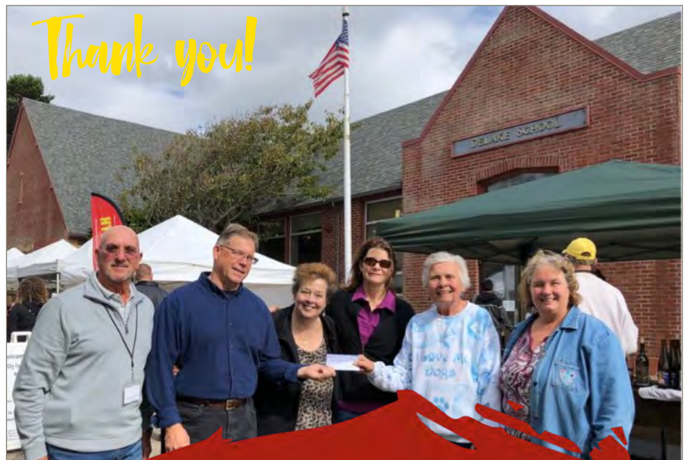
The Lincoln City Farmers & Crafters Market gave the first donation to the Cultural Plaza Campaign, with a $500 contribution in October 2018.