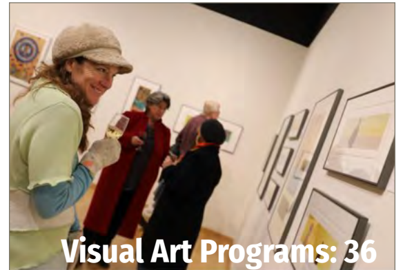
Visual Art Programs: 36