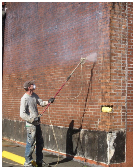
In late fall, Lincoln City Urban Renewal Agency began work on the repair and restoration of the south wall. Above, a local painting contractor applies sealant to the newly-exposed brick.